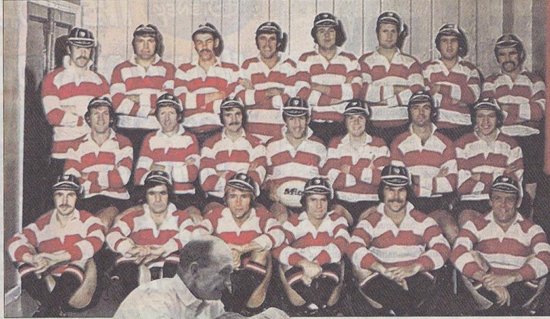
■ 1972: The Gloucester team which became national knockout competition winners.